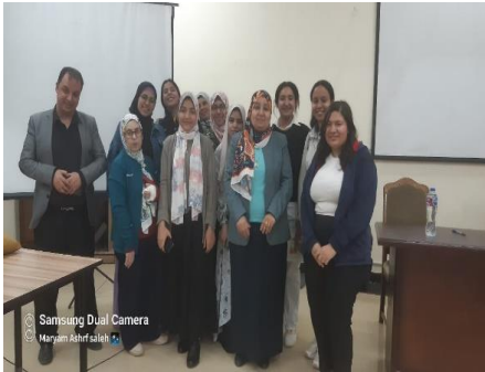
Students' creative composition in verse and recitation both in Arabic and English in World Poetry Day 19 March 2023

The Program provides a distinguished stimulating learning experience to be a well - qualified creative teacher , a proficient translator , a competent trainer and a researcher capable of meeting future challenges and offering solutions