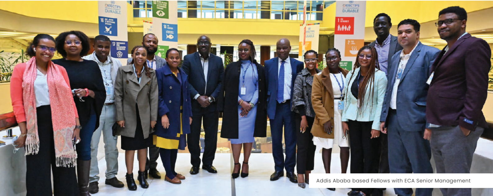
Addis Ababa based Fellows with ECA Senior Management