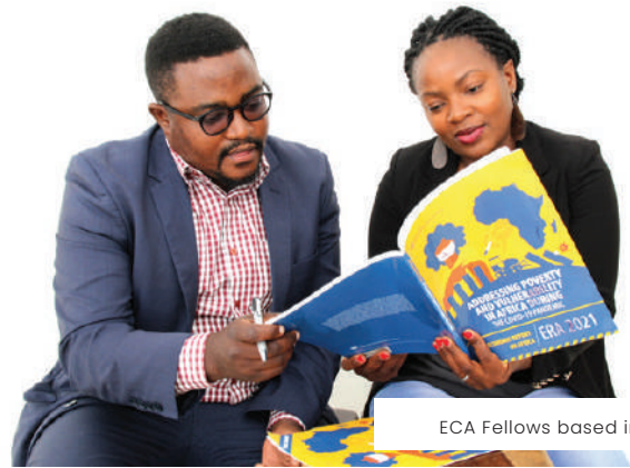
ECA Fellows based in SRO-SA