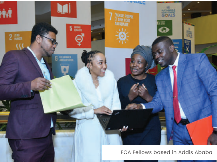
ECA Fellows based in Addis Ababa