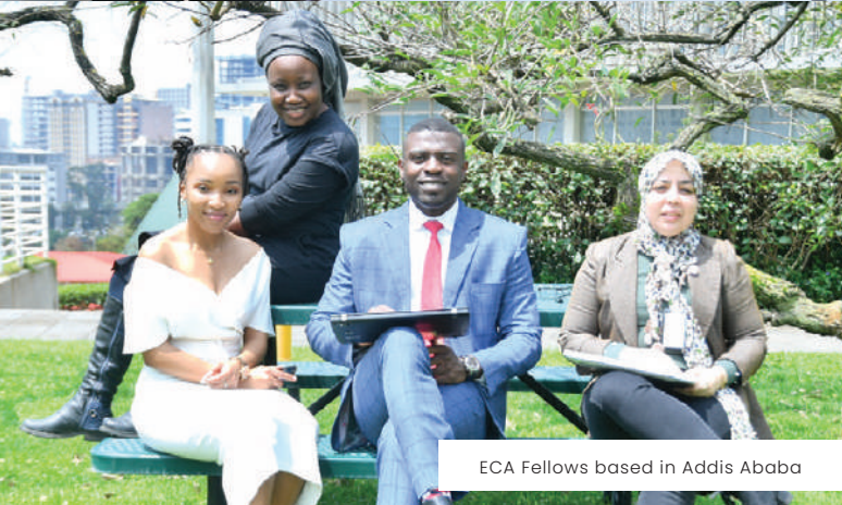
ECA Fellows based in Addis Ababa