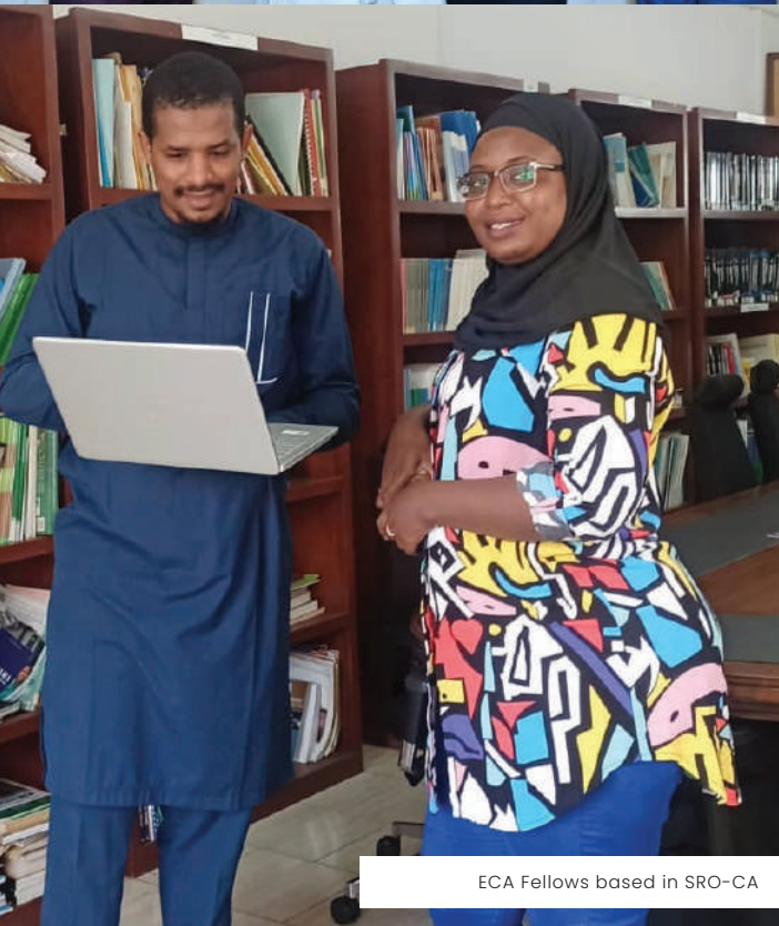
ECA Fellows based in SRO-CA